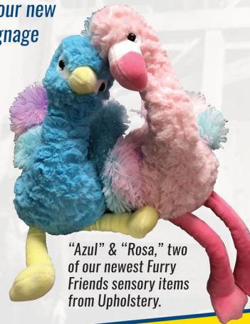
"Azul" & "Rosa," two of our newest Furry Friends sensory items from Upholstery.