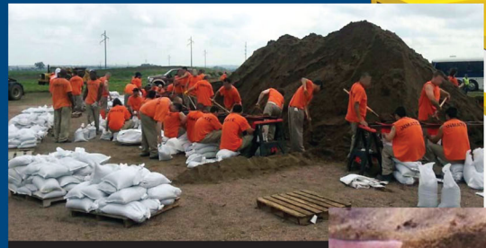
The efficiency of community sandbagging operations like these would be greatly improved by this new system.

Our Sandbag Machine is a gravity-fed, sandbag-filling system used to fill four (4) sandbags simultaneously. Constructed of 12-gauge steel, the lightweight and portable machine comes with a safety grid, safety shield, and is equipped with four, foot-pedal-operated chutes capable of filling at least 1400 bags per hour using unskilled labor.